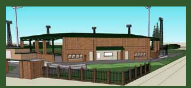
• Ballpark entrance improvements, including a tribute to the history of baseball in Bismarck